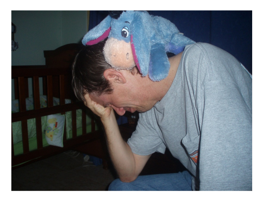
Photo from that night. I was crying from joy, and incredulity. This was about 3 am, after about 7 hours of activity.